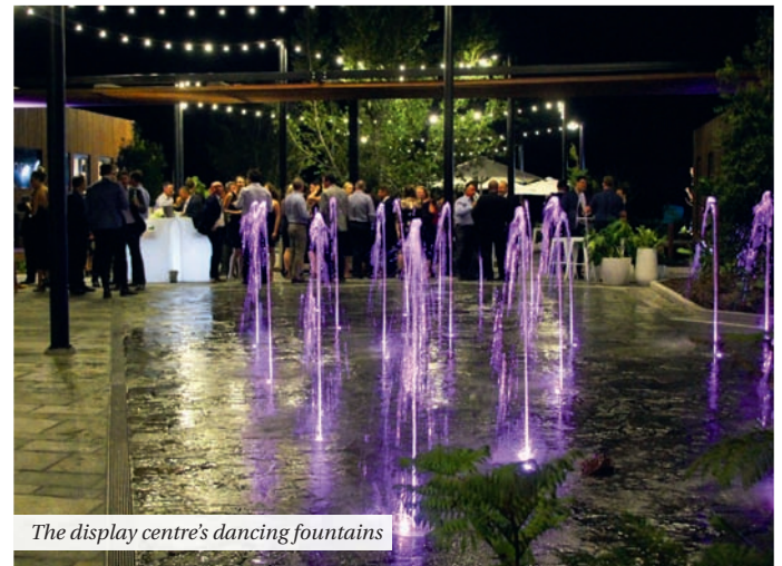
The display centre's dancing fountains

12 Blackall Street, Woombye 5442 1855 elderswoombye.com.au 5 Margaret Street, Palmwoods 5478 9122 elderspalmwoods.com.au